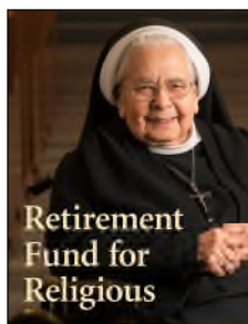
Retirement Fund for Religious

For those parents who have children attending St. Vincent de Paul Grade School, you are required to attend either Wednesday or Thursday evening.