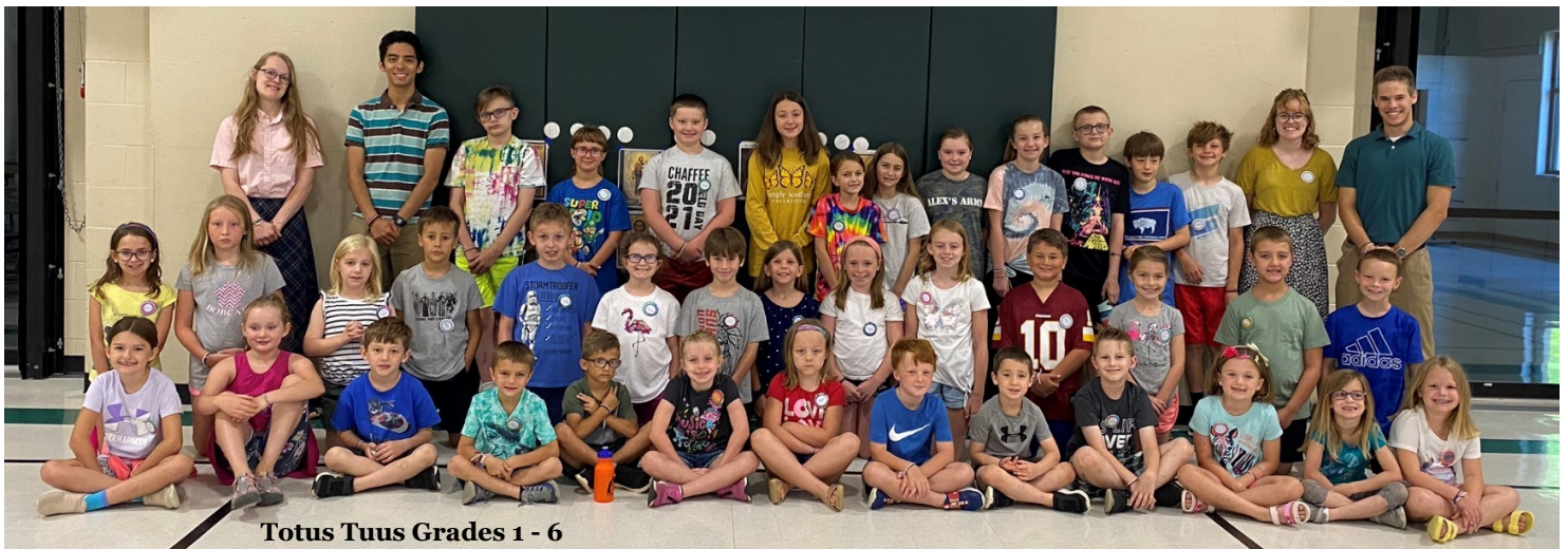
Totus Tuus Grades 1 - 6