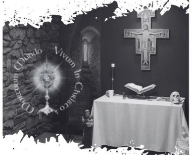
Ioin us for DTS The Old Convent @ St. Vincent