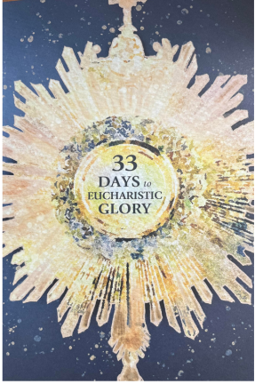
sponsored by the St Vincent de Paul Parish Discipleship Committee

May he and all the souls of the faithful departed, through the mercy of God, rest in peace.