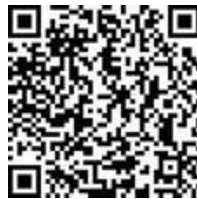
Managing My Giving