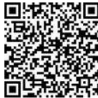
Creating and Editing Gifts