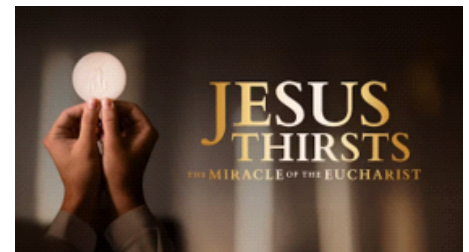
Jesus Thirsts: The Miracle of the Eucharist