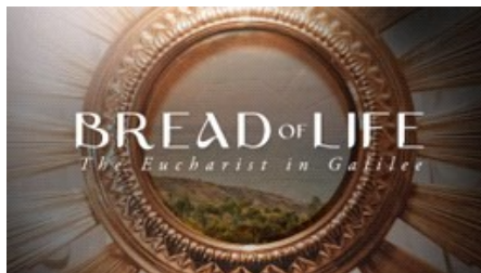
Bread of Life: The Eucharist in Galilee

If the teaching that Jesus is truly present in the Eucharist – Body, Blood, Soul and Divinity – is difficult for you to grasp, do yourself a favor and check out any of these outstanding resources about the Eucharist brought to you by the Augustine Institute on Formed.org: https://formed.org . Scroll on the home page to “The Eucharist” or use ‘search.’