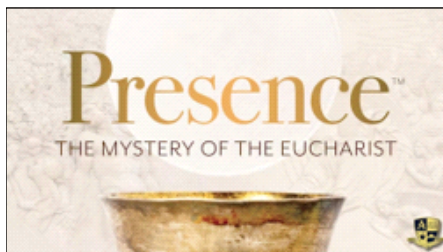
Presence: The Mystery of the Eucharist